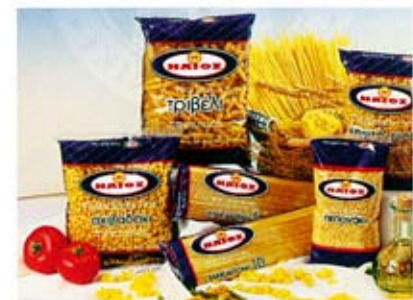
Macaroni long cut, Pasta short cut, 12 p. x 500 gr., 24 p. x 500 gr.