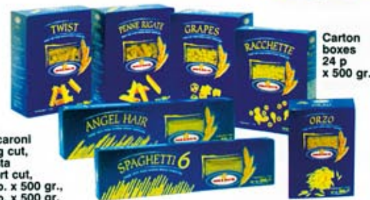
Carton boxes 24 p x 500 gr.