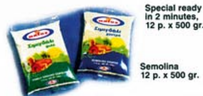
Special ready in 2 minutes, 12 p. x 500 gr.