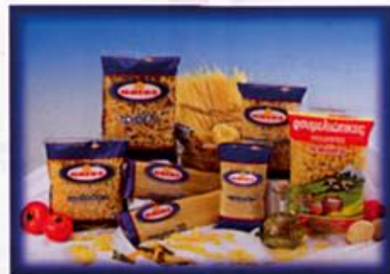
Macaroni long cut, Pasta short cut, 12 p. x 500 gr., 24 p. x 500 gr.