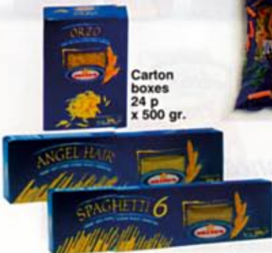
Carton boxes 24 p x 500 gr.