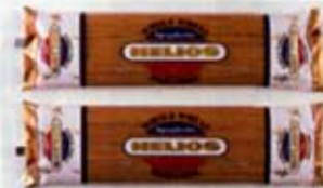
Macaroni pasta whole wheat, 12 p. x 500 gr.