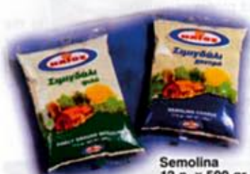
Semolina 12 p. x 500 gr.

From the very beginning of its establishment (70 years ago) Helios Pasta Industry is strictly devoted to quality. The excellent quality of all the HELIOS products has been recognized by internationally known organizations, which have awarded the industry numerous prizes.