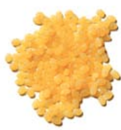
● SOUSSAMAKI 15