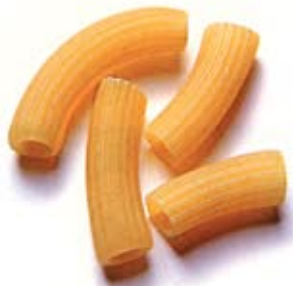
● SELINO (RIGATONI) 22