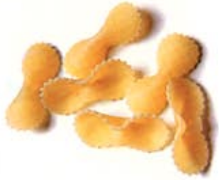
● FIGAKI (BOWS) 25