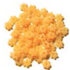
● ASTRAKI (STELLINA) 17