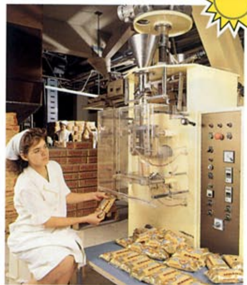
5. HELIOS pasta is packed in air-tight packages and undergo strict quality control before they are delivered to consumption.