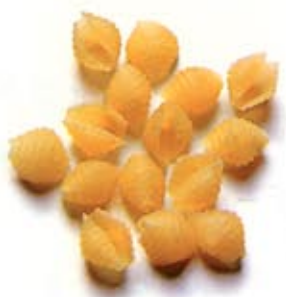
● AHIVADAKI (SHELLS FINE) 23