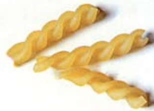
● TRIVELI (TWISTS) 24