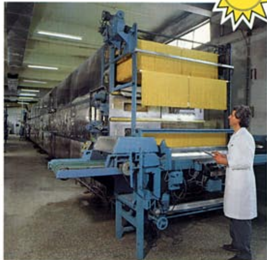
4. Cutting takes place automatically without the intervention of human hands.