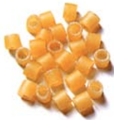
● KOFTO MISSO (CUT MACARONI FINE) 20