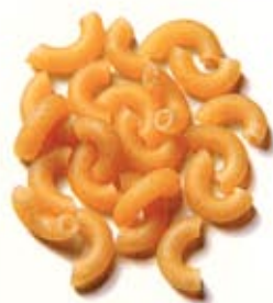
● CORALI (ELBOW) 21