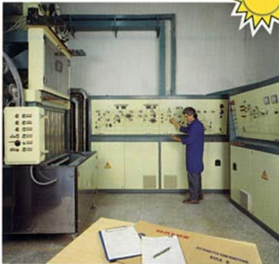
1. All machines of the factory function automatically through a central computer.