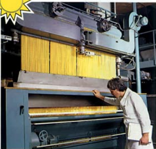
3. High temperatures are developed in the driers and completely sterilize the HELIOS pasta products.