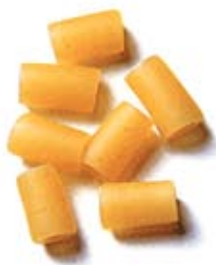
● KOFTO HONDRO (CUT MACARONI LARGE) 18