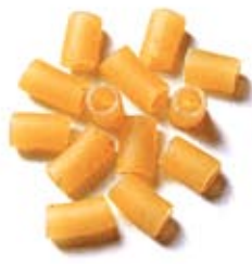
● KOFTO METRIO (CUT MACARONI MEDIUM) 19