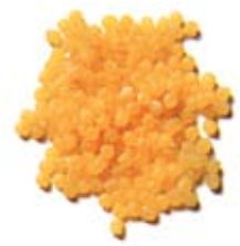
● COUSCOUS 16